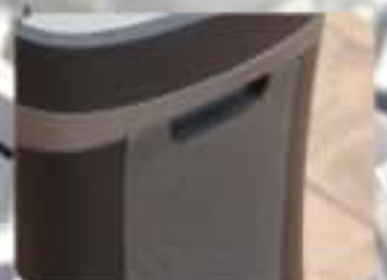
Motor with Thermal Protection Level Display through Bin Window Detection