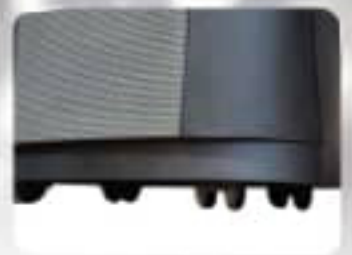
Attached Castors for easy maneuverability