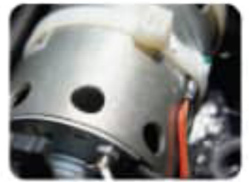
Motor with Thermal Protection