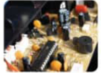
Control System – Auto Start/Stop, Auto Reverse when Paper Jam, Overload & Overheat Sensor