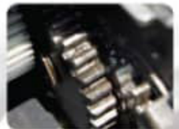
Combination of Steel & Plastic Gear System