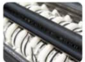
Robust Construction with Replaceable Cutting Blades