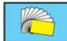
16 Sheets Capacity